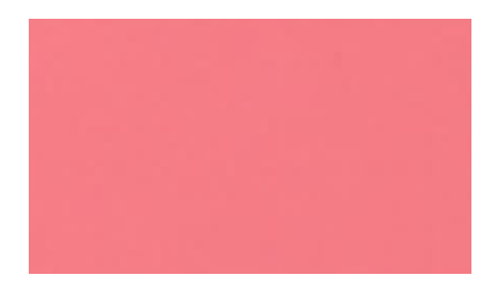
Tint 1:10 TiO<sub>2</sub>