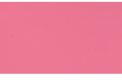
Tint 1:10 TiO<sub>2</sub>