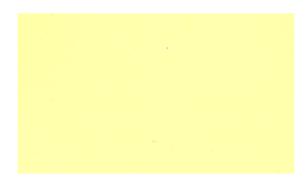
Tint 1:10 TiO<sub>2</sub>